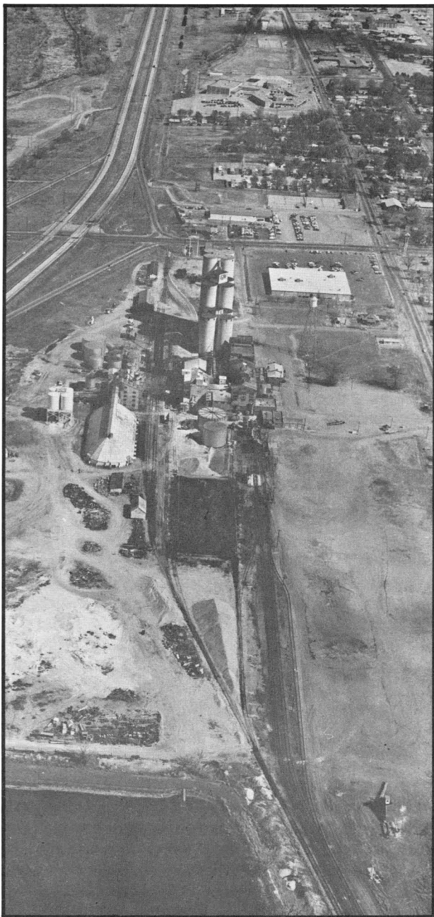
The increased availability of irrigation water can lead to more agricultural product processing facilities such as this sugar mill at Fort Morgan, Colorado. New farm production, however, can displace farms and processing facilities located elsewhere.